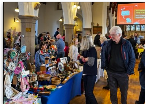
Crafts and other bargains on sale at the church's Christmas Fair

It was a great to see so many people popping into church on 25th November to attend our Christmas Fair. There were lots of stalls with loads of potential Christmas gifts and refreshments for all.